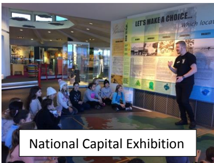
National Capital Exhibition

This excursion gave the children a more meaningful insight to the Social Systems and Structures of the Australian Nation. It helped to explain the structures, roles, responsibilities and decision-making processes of Federal Government and explain why Australians value fairness and socially just principles.