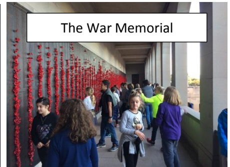
The War Memorial