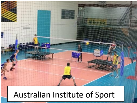
Australian Institute of Sport