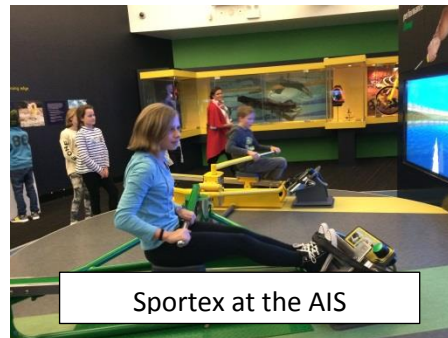
Sportex at the AIS